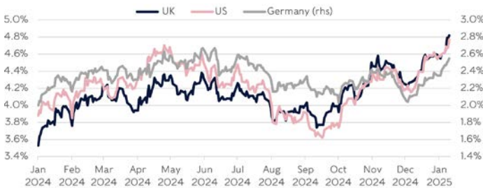
Source: FactSet; data to 10 January

The big question for 2025 is the same as it was in 2024: how much will central banks be able to cut interest rates in the face of strong economic growth in the US and stubborn inflation virtually everywhere? As 2025 dawns, the prevailing answer is just one quarter-percentage-point reduction by July – if that.