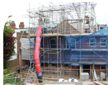
Project converting two terrace houses into high quality homeless accommodation