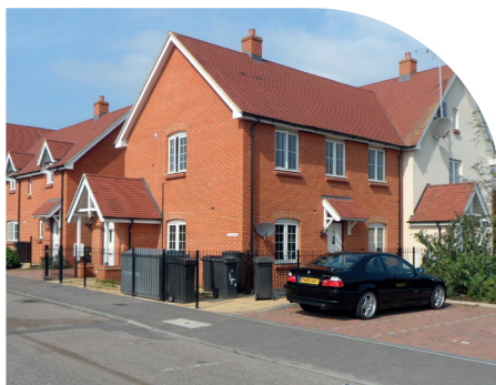
High quality social housing