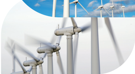
No construction risk