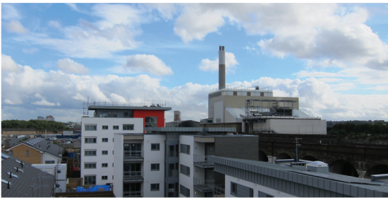
Central heating from waste plant