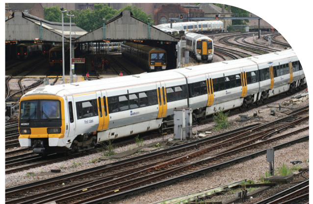
Taking you from A to B