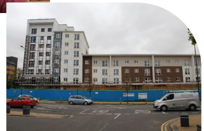
Project redeveloping Marylands plaza into social and affordable homes