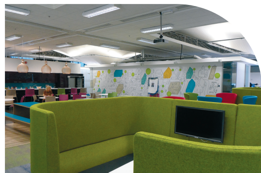
Community employment support project