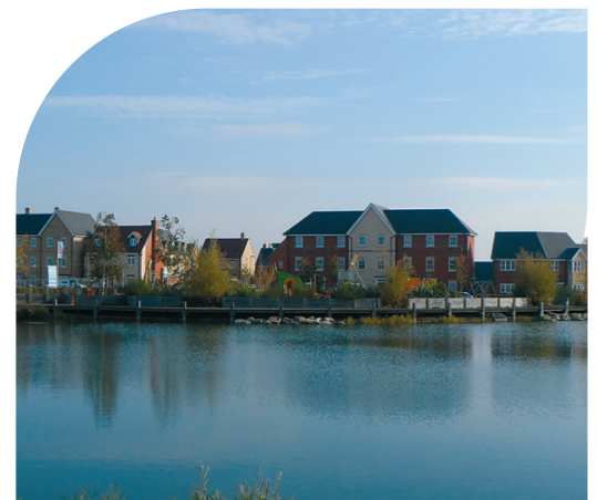
A range of housing projects